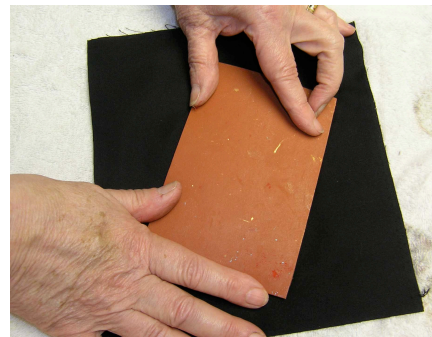
Stamp the surface