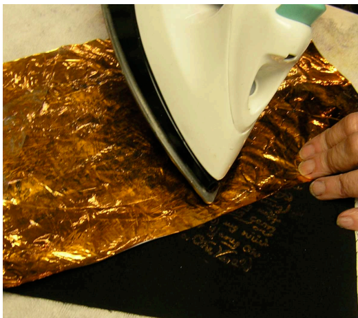
First layer applied

Basic technique -- Place the foil on the dry adhesive with the color (shiny) side facing up. Set the iron on dry cotton setting, turn slightly onto its edge, apply foil using the side edge in a burnishing motion. Direct contact of the iron removes the foil, so be sure to keep the iron on the mylar (or use a sheet of parchment paper on top of the foil).