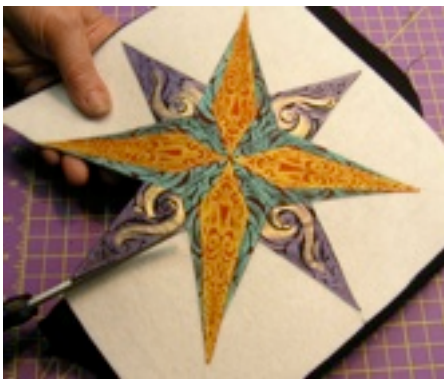
Cut out the star